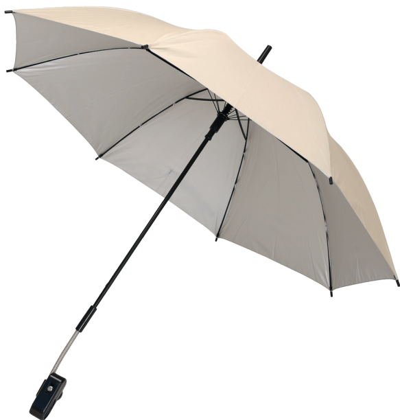
Cat No 118914DP