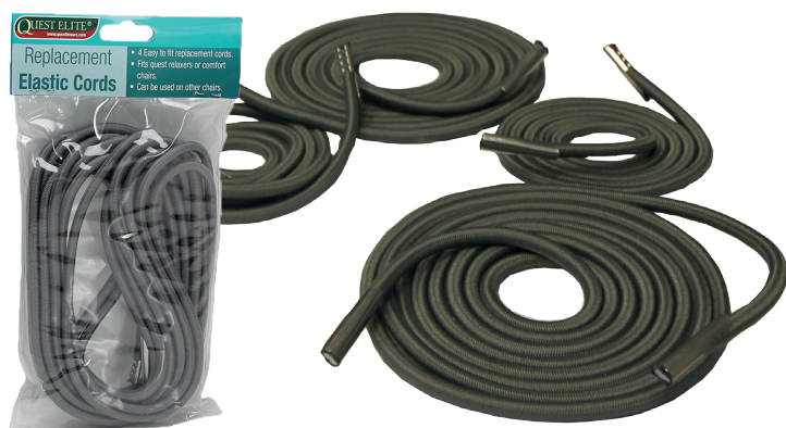
Cat No 124901