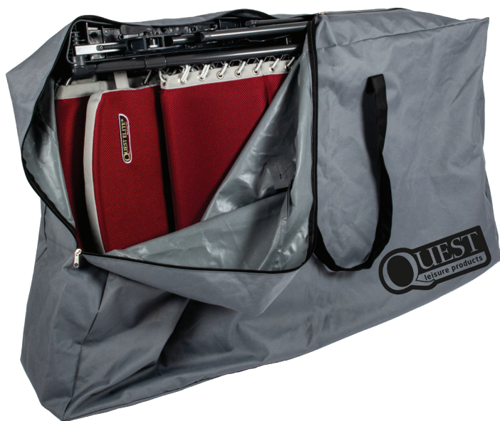
Cat No 124900

Along with the other items in the Naples Pro range there are other optional accessories available for your product.