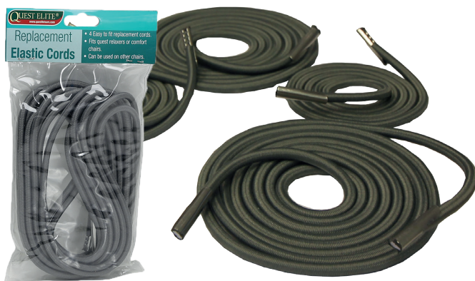
Cat No 124901