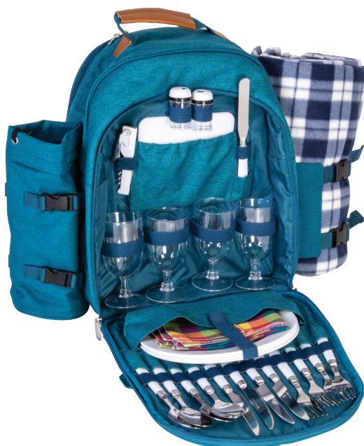
Cat No K0403