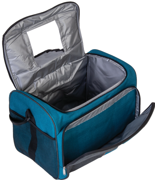
Cat No K0400

This product is part of the Quest Lakeland range of products. These ranges includes the following items that are matched with your product.