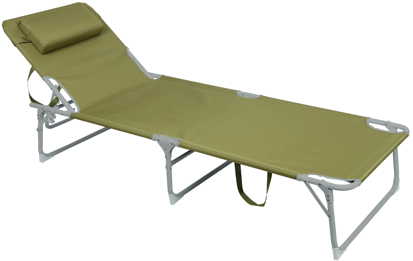
Image shown is in green as red version was not available at time of printing. See the F2083R for colour matching.