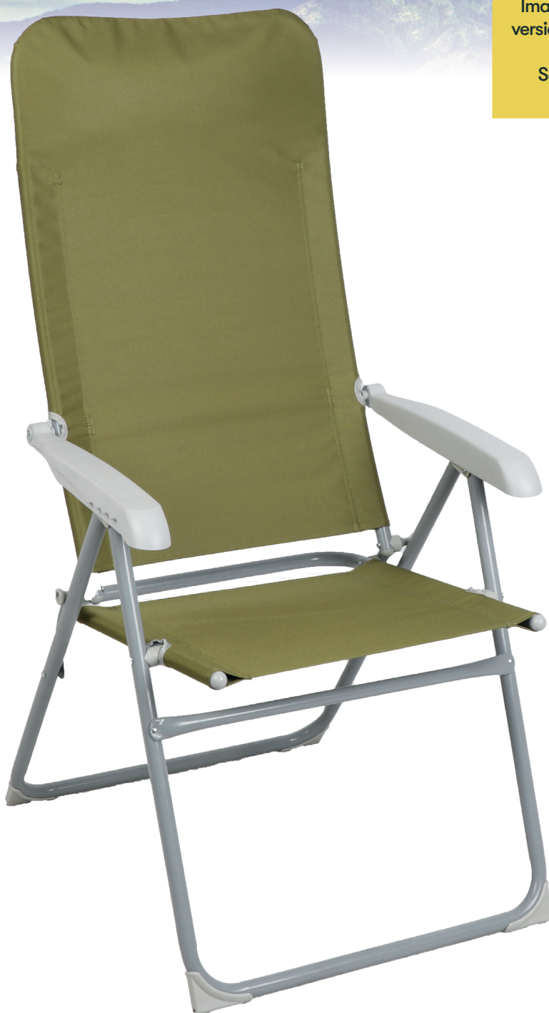
Image shown is in green as red version was not available at time of printing. See the F2083R for colour matching.