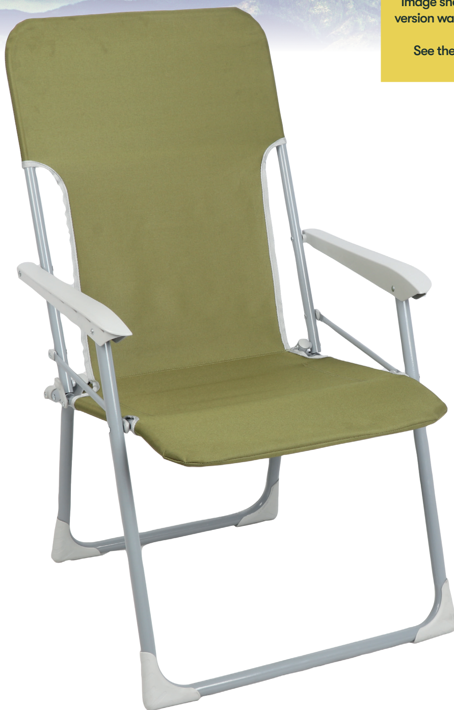
Image shown is in green as red version was not available at time of printing. See the F2083R for colour matching.

A modern take on the classic captains and deck chair. Simply take it out unfold in one, sit back and unwind. Styled to fit in with the rest of the Kew range and comes in red or green.