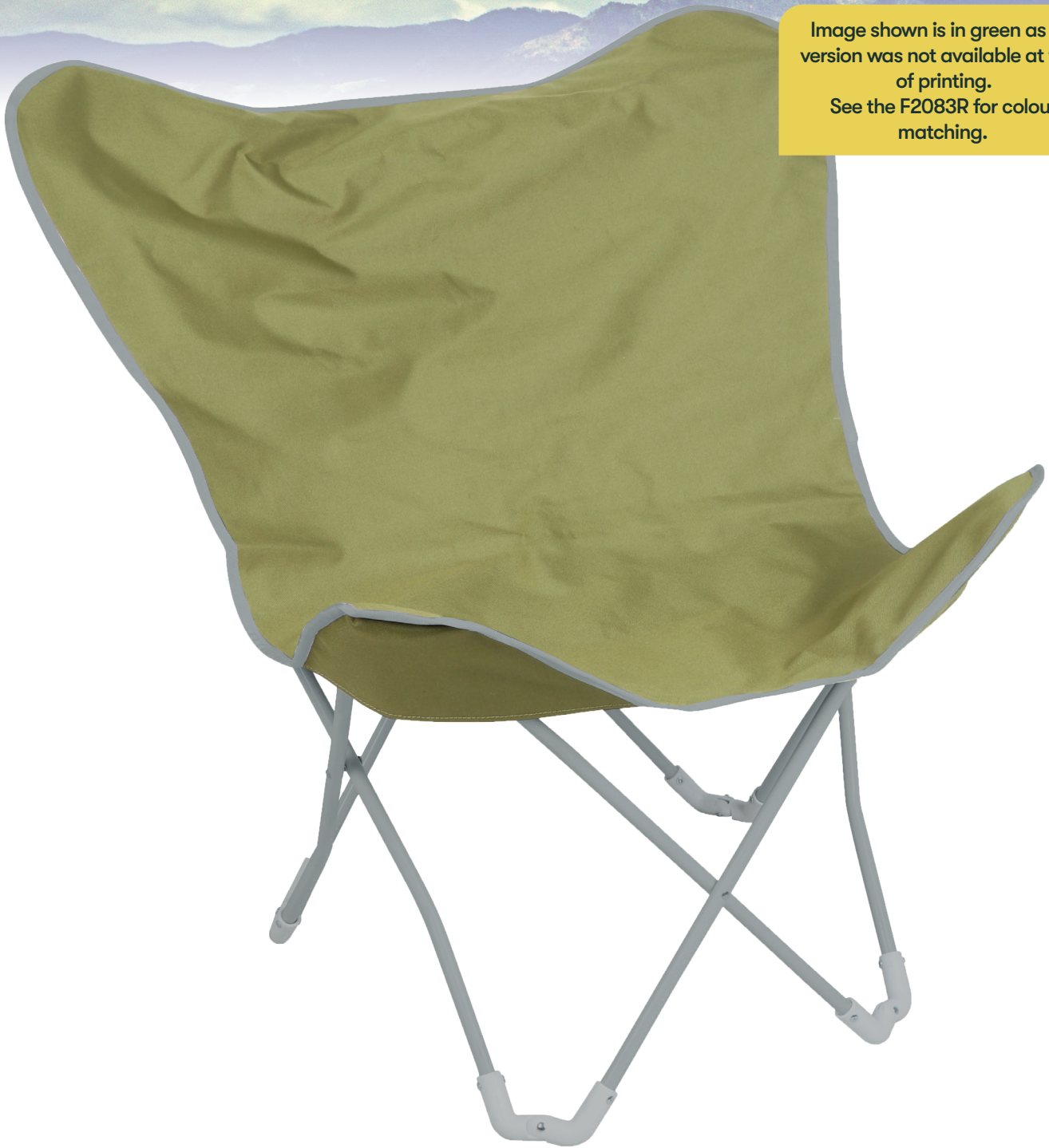
Image shown is in green as red version was not available at time of printing. See the F2083R for colour matching.