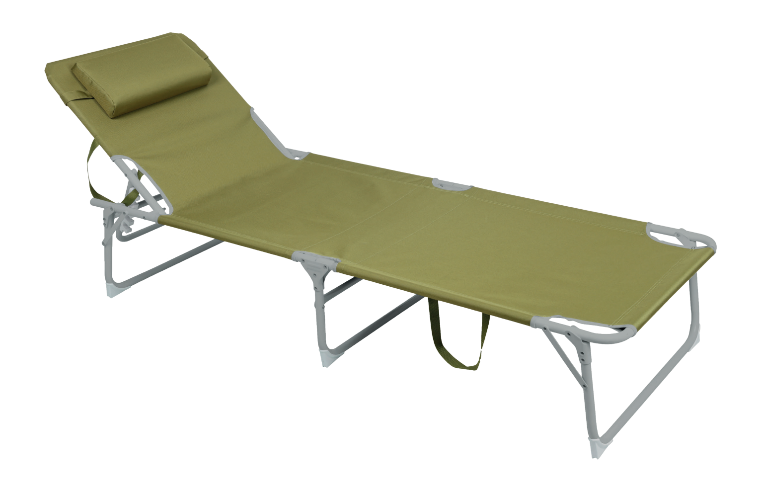
Image shown is in green as red version was not available at time of printing. See the F2083R for colour matching.