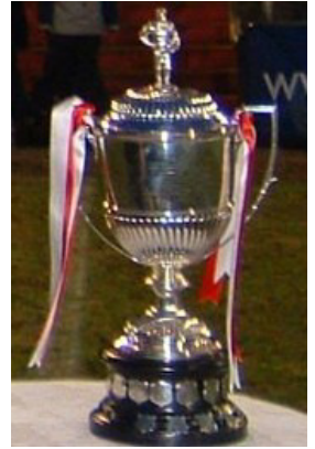
The Law Cup

Watch this space for further updates and Law Cup facts.