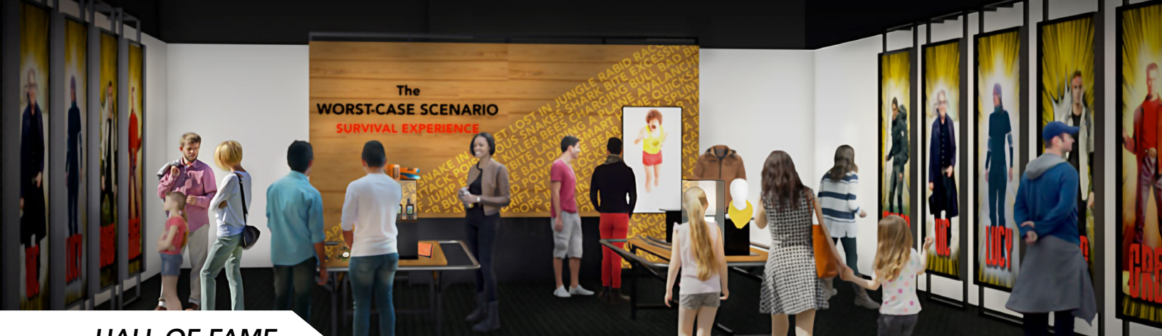
HALL OF FAME