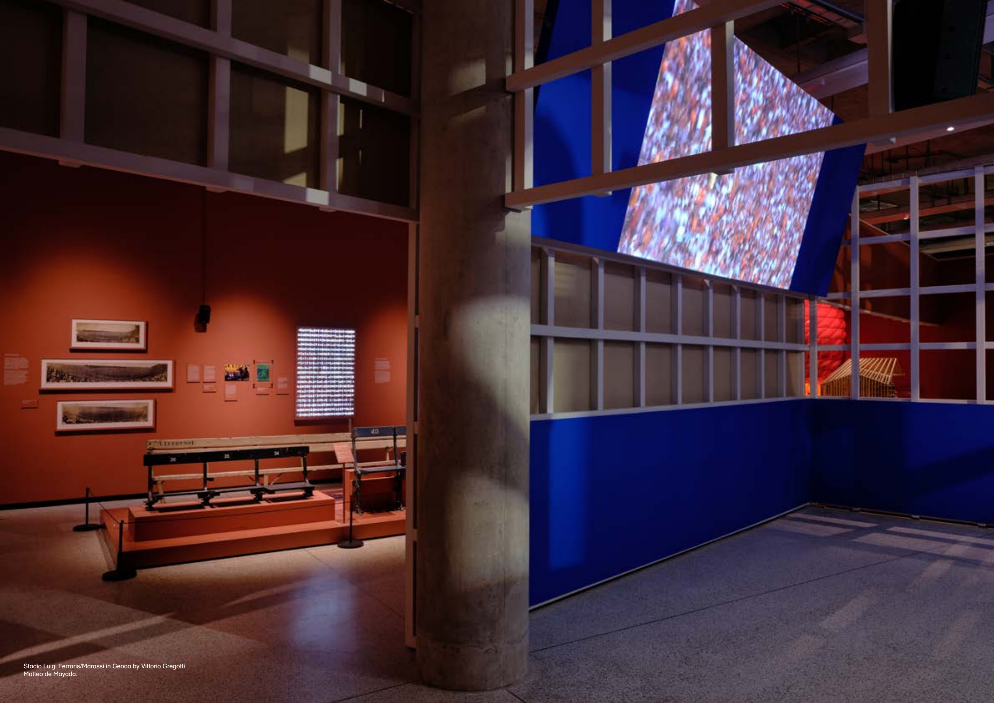
Stadio Luigi Ferraris/Marassi in Genoa by Vittorio Gregotti Matteo de Mayada.