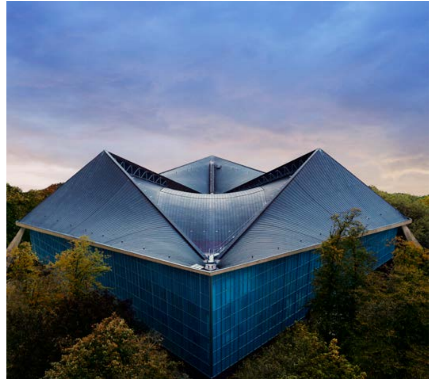
The Design Museum, London