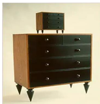
Gord Peteran, Chest on Chest , 1984