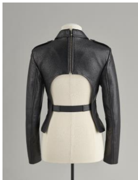
Izzy Camilleri, Leather Jacket , 2018

Post-Modernism and Beyond: The 1980s saw the return of colour, decoration, and historicism — the tenets of postmodernism. Canadian designers continue to innovate in the global marketplace, drawing upon a wide range of cultural sources and technologies to address contemporary issues such as the environment and universal design in meaningful ways. For example, Izzy Camilleri's Leather Jacket was designed to accommodate wheelchairs.