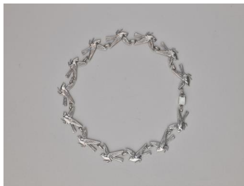
Carl Poul Petersen, Bird Necklace