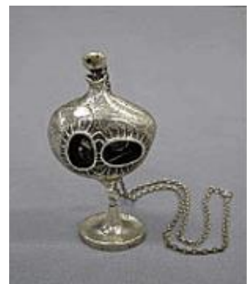
Guy Vidal, Pendant with "moon rocks", c. 1970s