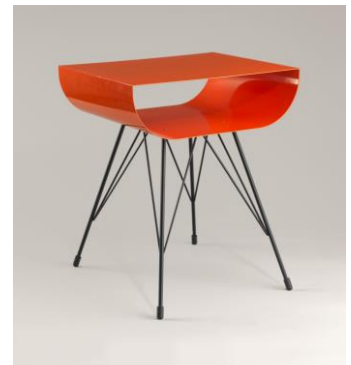
Johnny Lim, Star 69 Side Table , 1998