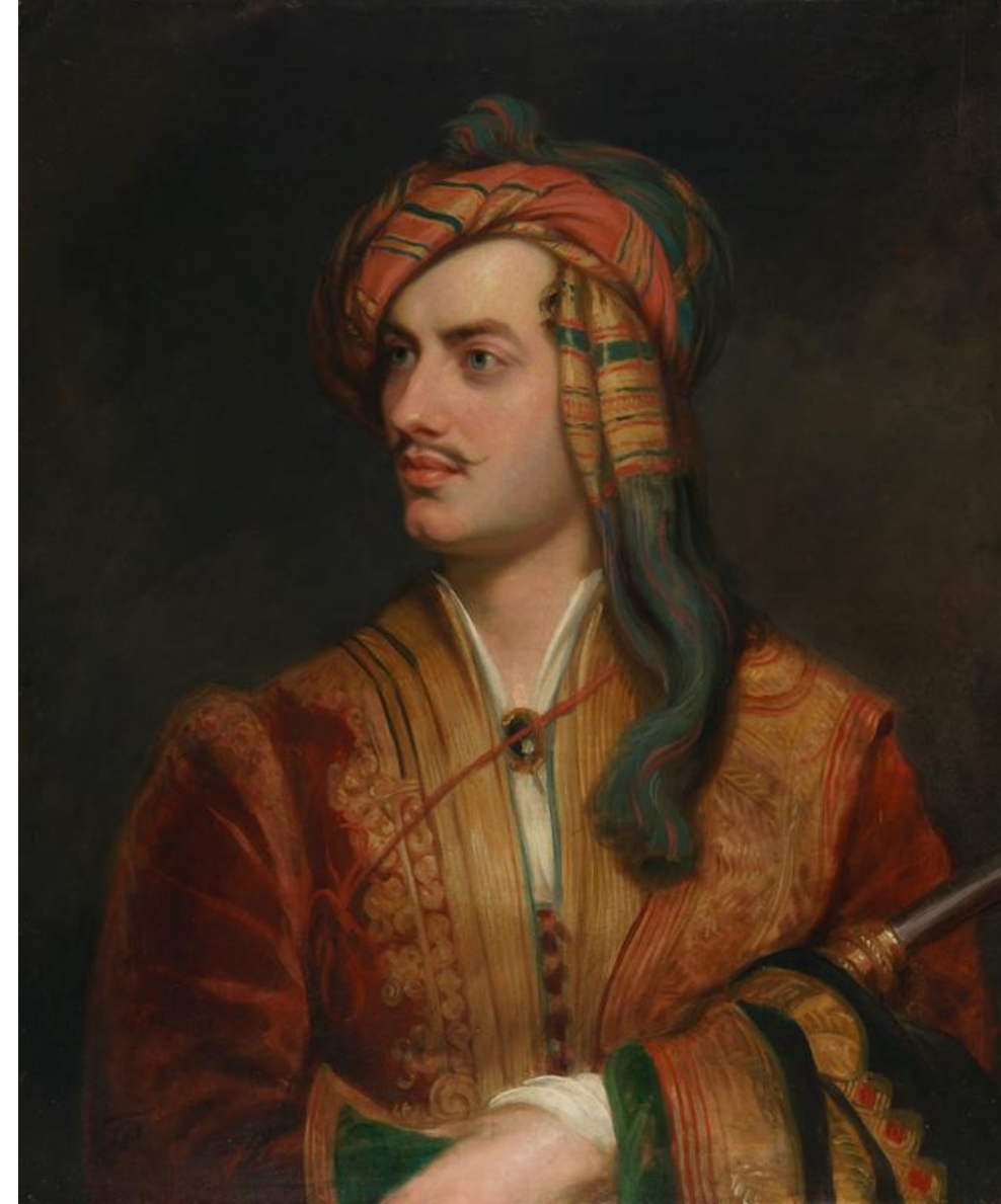
Creative Couples: Literary Love George Gordon Byron, 6th Baron Byron by Thomas Phillips, oil on canvas, circa 1835, based on a work of 1813, NPG 142