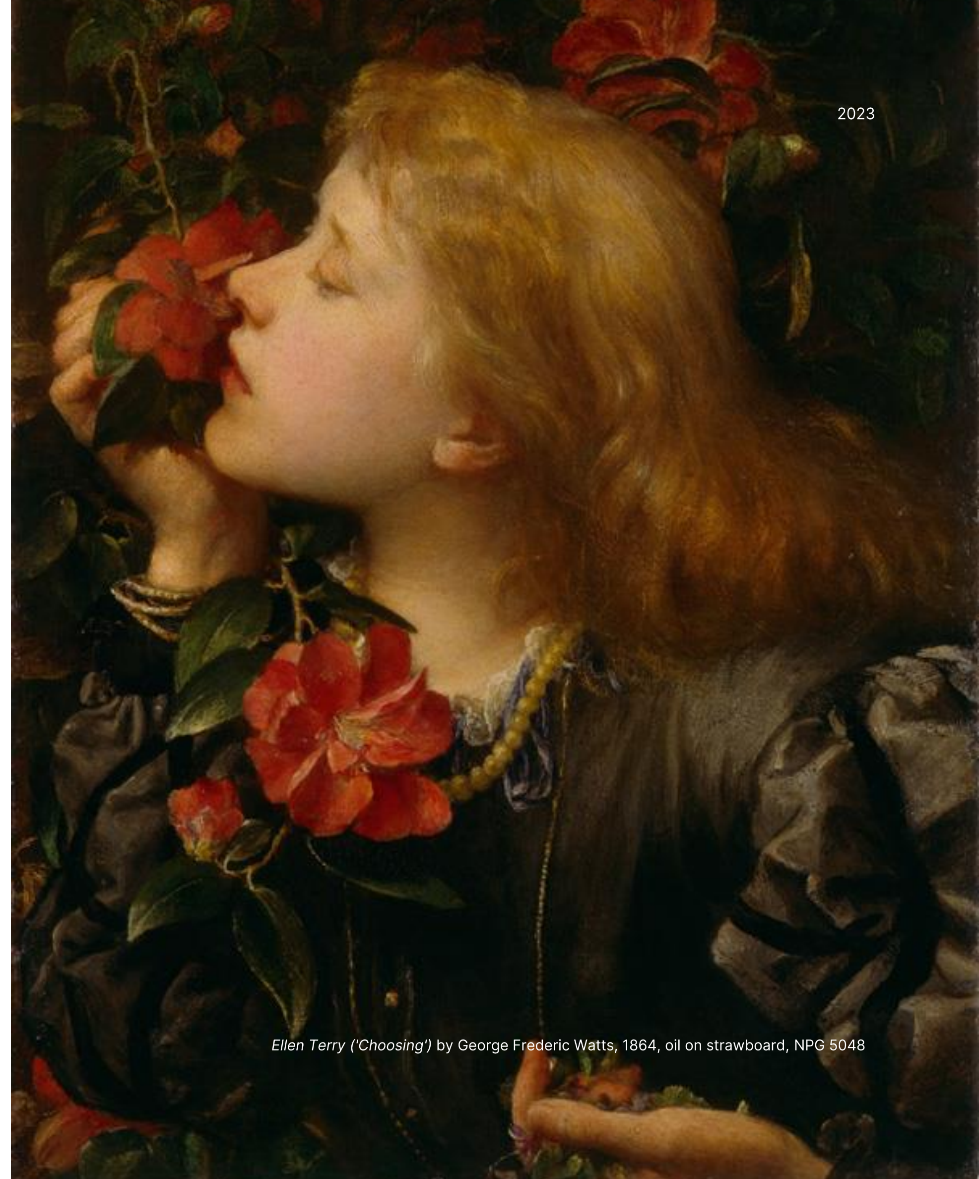
Ellen Terry ('Choosing') by George Frederic Watts, 1864, oil on strawboard, NPG 5048

At the heart of this exhibition are a series of real-life love stories, from Van Dyck to the present, that are grouped thematically. Each of the love stories sheds light on a different aspect of romantic love and the role of portraits within it, from images which capture an artist's obsession with their muse to those that record tragic love affairs or celebrate the triumph of love against the odds.