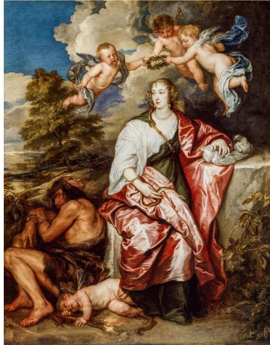
The Trials of Love: Scandal and Tragedy Venetia, Lady Digby by Sir Anthony Van Dyck, oil on canvas, circa 1633-1634, NPG 5727