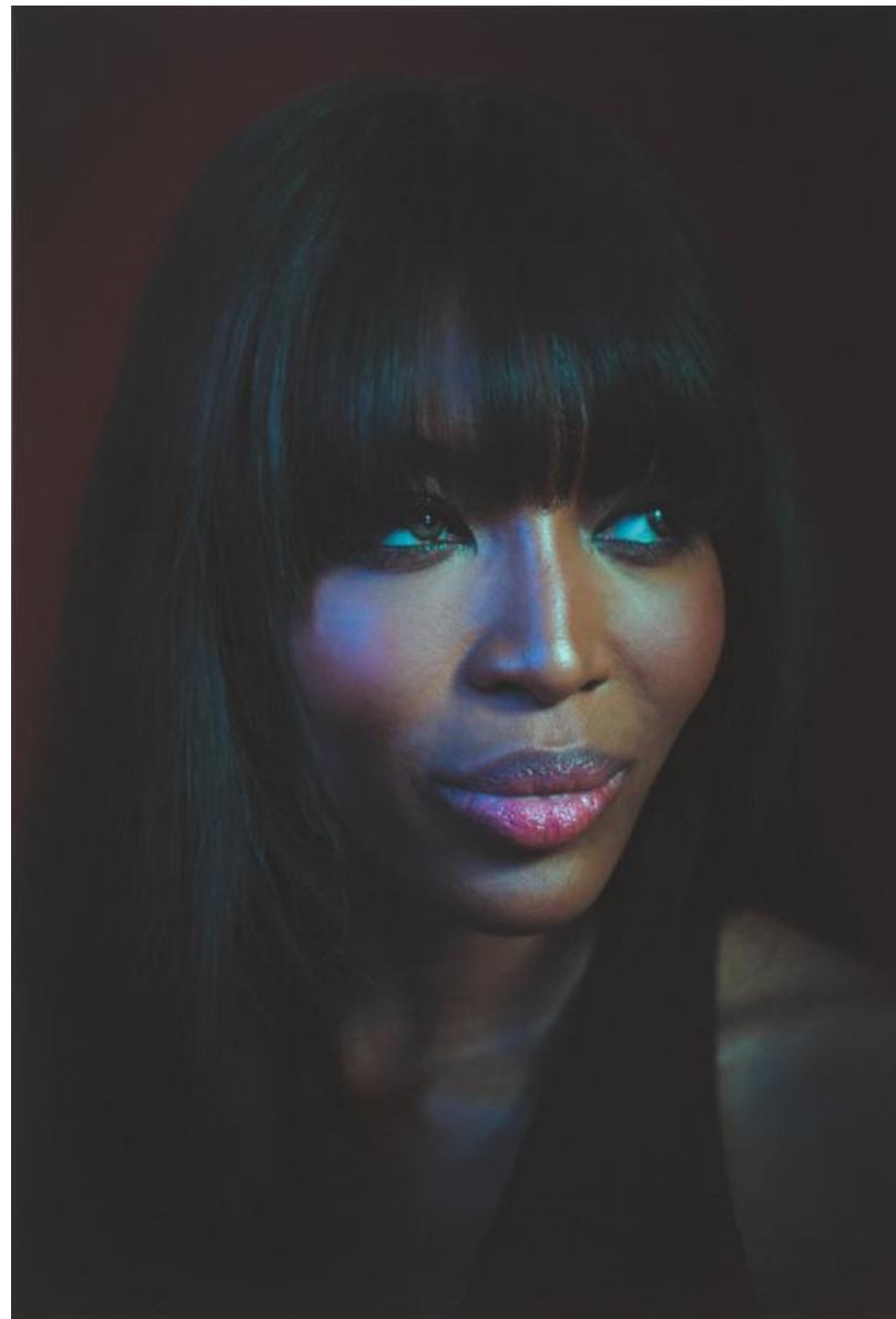
Obsessed by the Muse: Redefining the Muse Naomi Campbell by Simon Frederick, archival inkjet print, 2016, NPG P2035