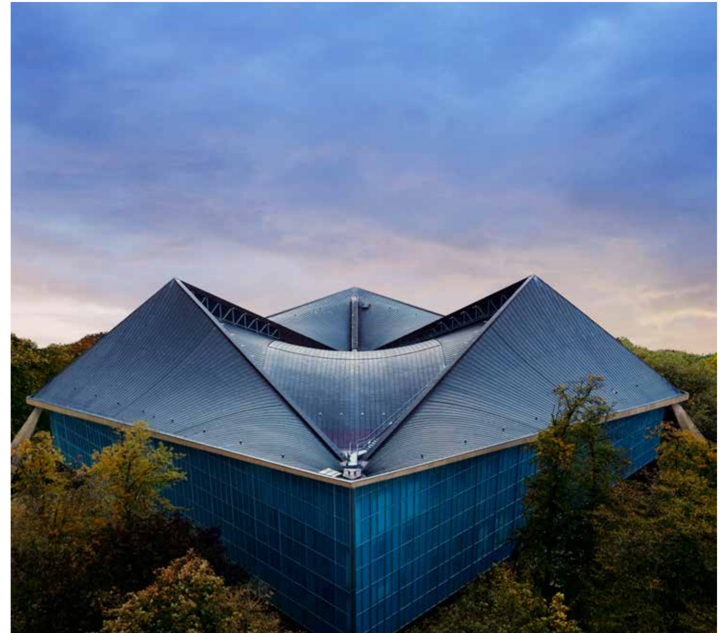
The Design Museum, London