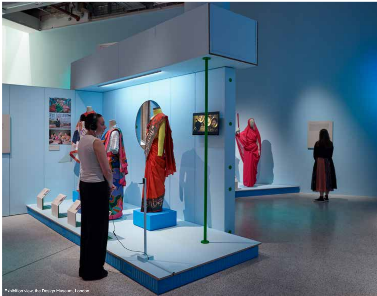
Exhibition view, the Design Museum, London.