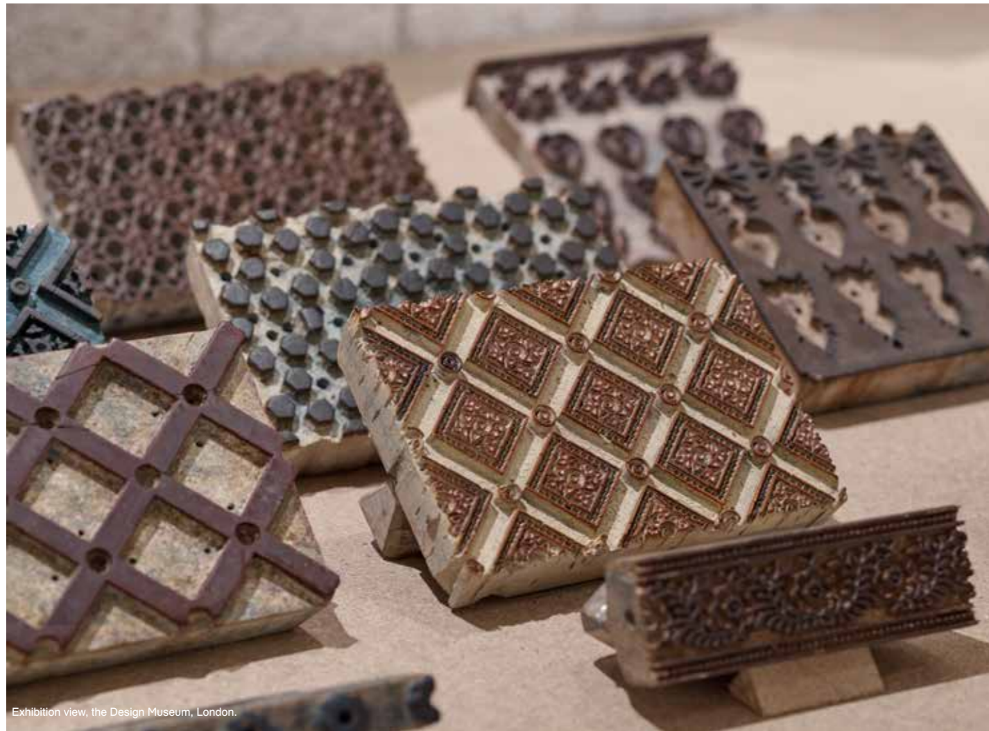
Exhibition view, the Design Museum, London.