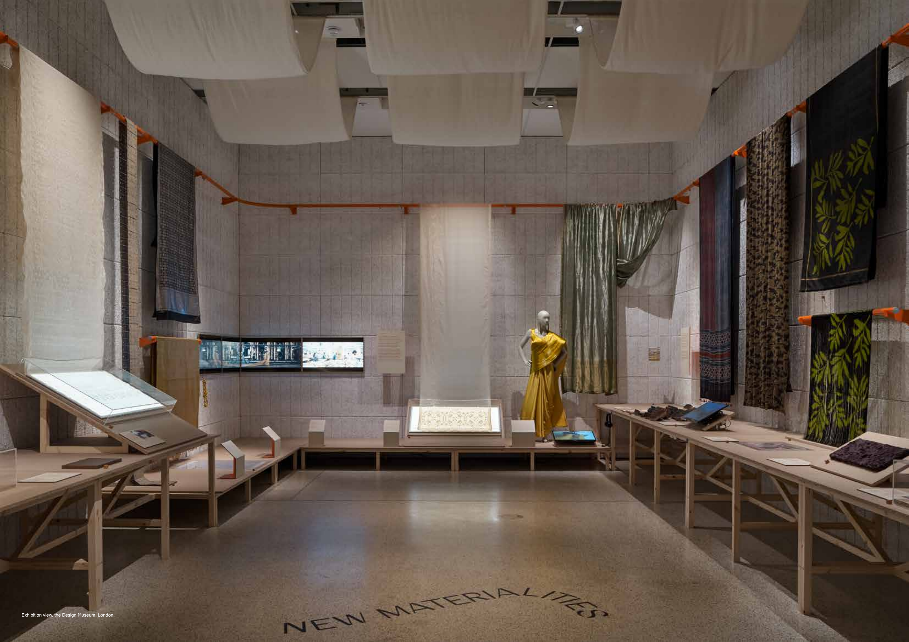
Exhibition view, the Design Museum, London.