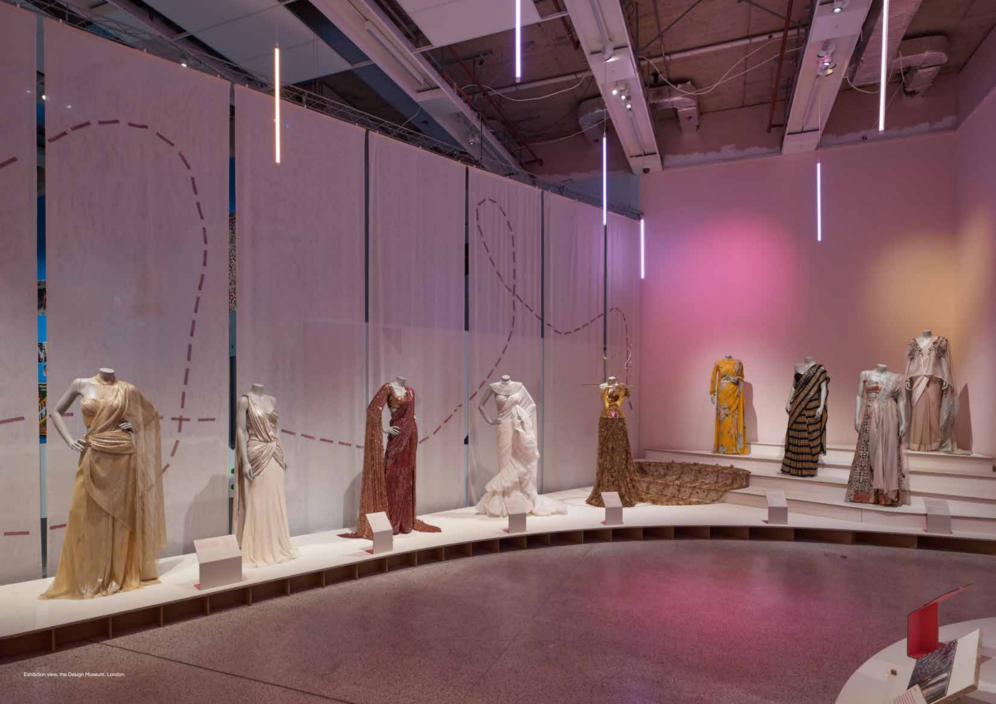
Exhibition view, the Design Museum, London.