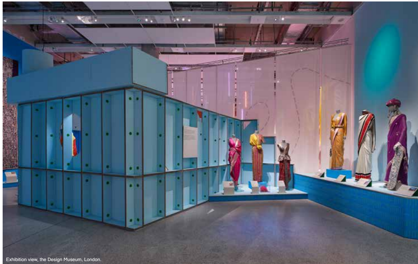
Exhibition view, the Design Museum, London.