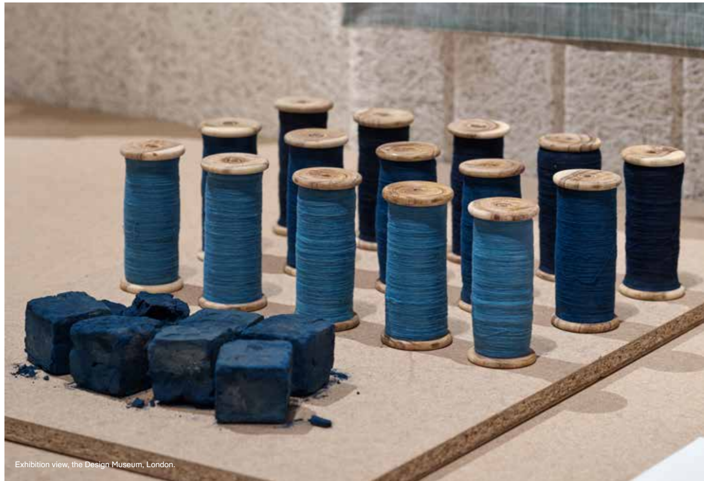
Exhibition view, the Design Museum, London.