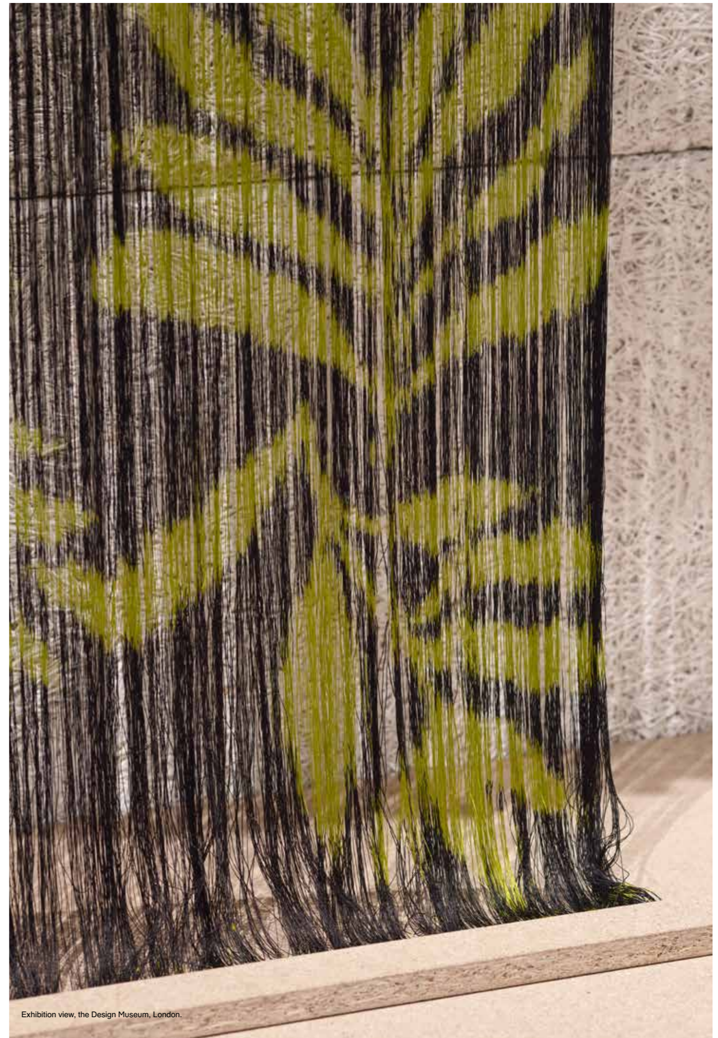
Exhibition view, the Design Museum, London.