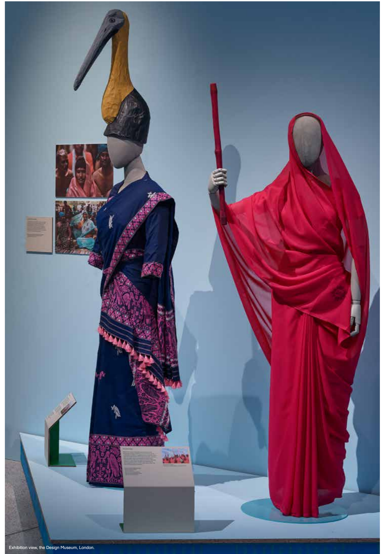
Exhibition view, the Design Museum, London.