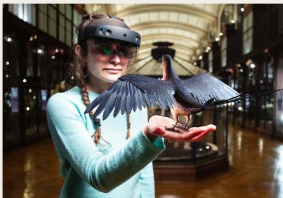
FILL WITH WONDER RAISING AWARENESS