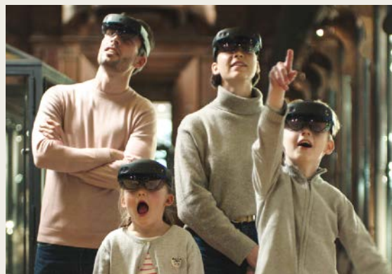
A SCENARIO-LED TOUR