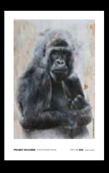
EXHIBIT GIFT SHOP PRINTS