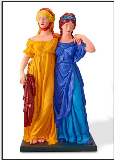
Hans-Peter Feldmann, Two Sisters, not dated (cast 2014/15)