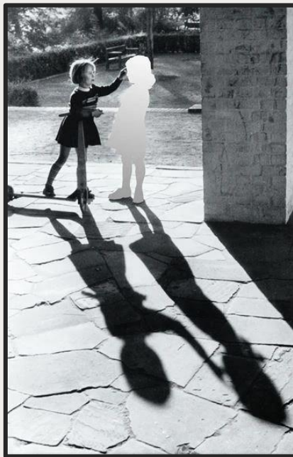
Hans-Peter Feldmann, Two Girls, 1999

The presentation of around 120 works will highlight the breadth of Feldmann's oeuvre: from his early photographs, taken in the 1970s, his sculptures with everyday objects and his large-scale installations to more recent works, which will be shown in Düsseldorf for the first time. It is the first exhibition after Feldmann's death in May 2023 and the last show, which he was actively involved in.