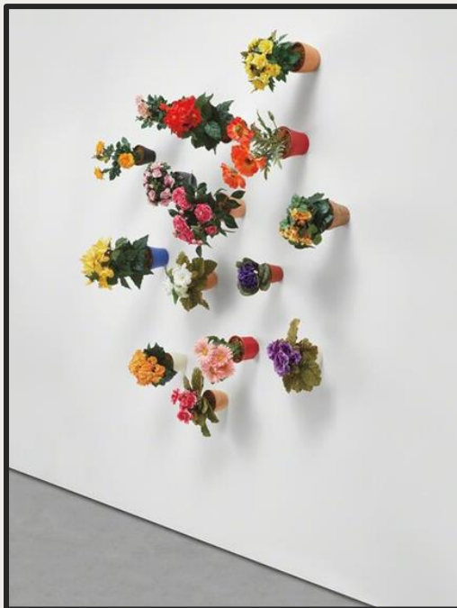
Hans-Peter Feldmann, Horizontal Flower Pots, not dated

Many of the themes that were to become central for Feldmann already appear in his early work and recur again and again: everyday life, social clichés, voyeurism, private and public spheres, the formation of taste, humour and satire, dreams and projections. From the outset, Feldmann consistently pursued strategies of artistic appropriation, alienation and recontextualisation – what happens to a “beautiful” motif in front of the camera lens, how does an art historical quotation charge a sculpture, what “aura” does a banal object when placed on a white museum pedestal? Familiar things are seen differently and are being constantly rediscovered.