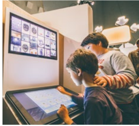
GRUMPY AND HAPPY

Facial symmetry is an important factor in our perception of beauty, but to what extent? In this mirror you can see your face as it is, and how it would look if it were perfectly symmetrical.