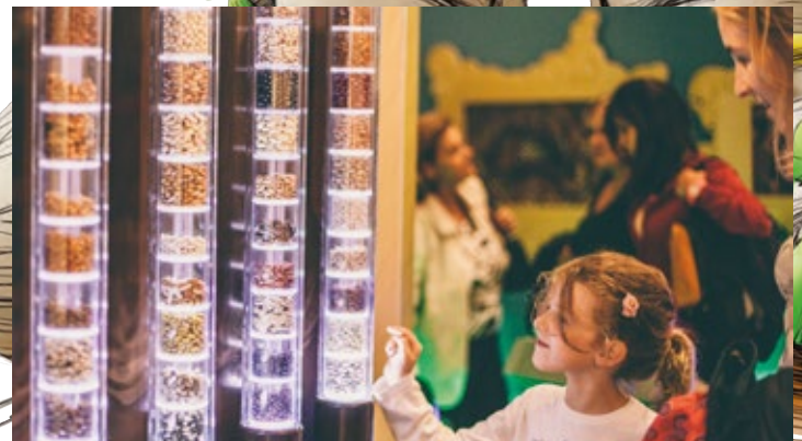
BEANSTALK VEGETABLE PATCH

Did you know that when you eat a steak you are consuming thousands of litres of water? Discover the water footprint associated with various everyday products and see the extent of a giant's ecological footprint.