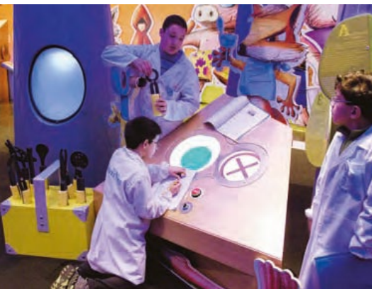
THE STORK AND THE FOX

The stork agrees to have dinner with the Fox, but this time she is alert. She takes all types of beaks with her in her toolbox such as: long, short, thick, thin, folded, shaped like a spoon beaks... Can you guess which is the best beak for each menu?