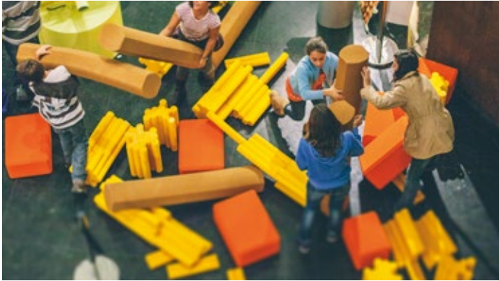
ALL TYPES OF HOUSES

Is brick stronger than wood and wood stronger than straw, as the story tells us? Not always! The resistance of a house depends not only on the material used, but also in the construction technique. To prove it let's see if the house falls down when the wolf blows.