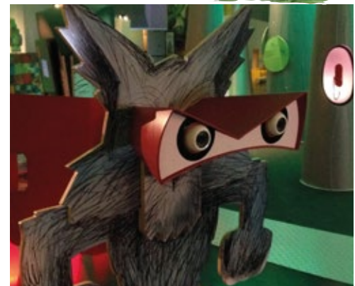
HOW WOLVES SEE COLOURS

I wonder if the wolf knew what colour Little Red Riding Hood was wearing.