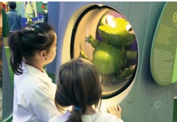
THE FROG AND THE OX

Try to make some shadows. Don't be afraid and let your imagination run wild!