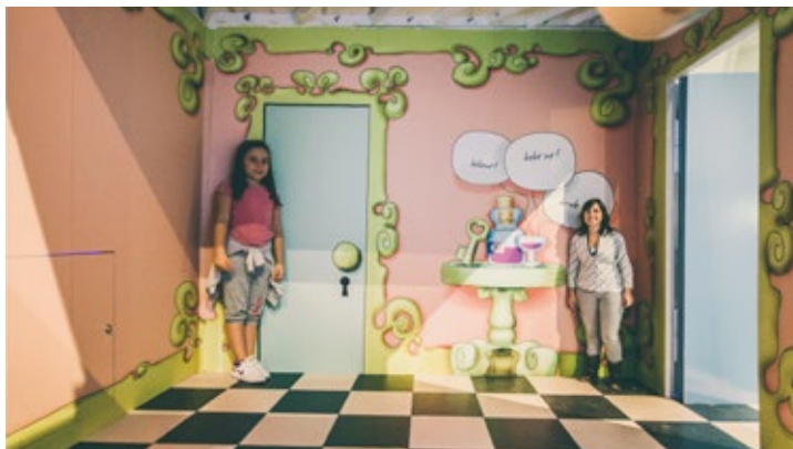
GROWING AND SHRINKING

We all know that we cannot suddenly stretch and shrink like Alice. However, the people who walk in this room seem to change size from one moment to the next. Let's find out what's happening?