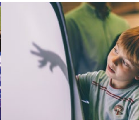
THE WOLF AND HIS SHADOW

The stork agrees to have dinner with the Fox, but this time she is alert. She takes all types of beaks with her in her toolbox such as: long, short, thick, thin, folded, shaped like a spoon beaks... Can you guess which is the best beak for each menu?