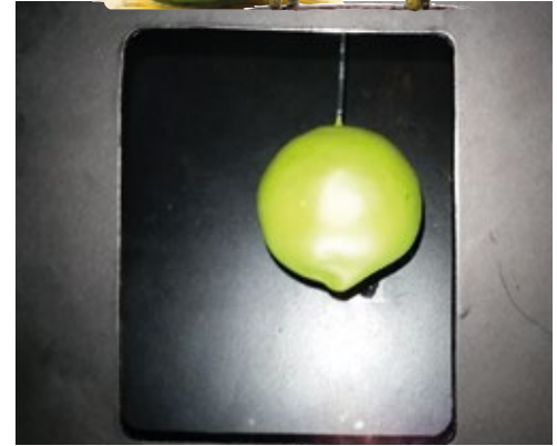
A PEA IN THE MUSEUM

You never sleep alone ... Here you can take a look at your unwanted sleeping companions.