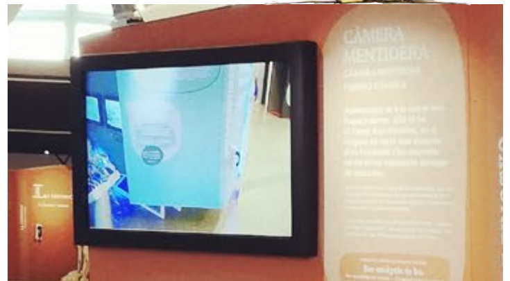
THE FIBBING CAMERA

This Pinocchio is impossible to control... when we lift his arm he stretches his leg and when we lift his leg he stretches his arm. Pinocchio is like human brain: when we learn something new, new circuits are established to reinforce with practice and repetition.