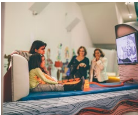
BIG BAD WOLF

Granny speaks of the forest, of how she can smell animals and hear the buzz of a mosquito at a distance. It can't be granny. But it also doesn't look like the bad wolf!