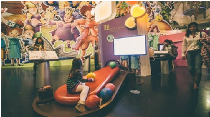
ON THE TIP OF YOUR TONGUE

How many flavours can our tongue detect? Only five: sweet, bitter, sour, salty and umami. It doesn't seem like much. The Bowlingua game shows why we are particularly sensitive to these five tastes.