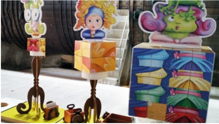
CUT AND STICHING

Her three sisters' dresses are made in the sewing shop. If the largest sister is twice as big as Cinderella, will we need twice the fabric? Find out that the area and volume of a cube does not increase proportionately.