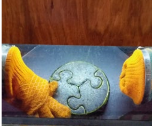
CONTEST FOR SENSITIVE PEOPLE

Being able to detect a pea is perhaps an exaggeration, but our sense of touch can be improved. Test your tactile sensitivity, building the puzzles hidden in the mattresses.