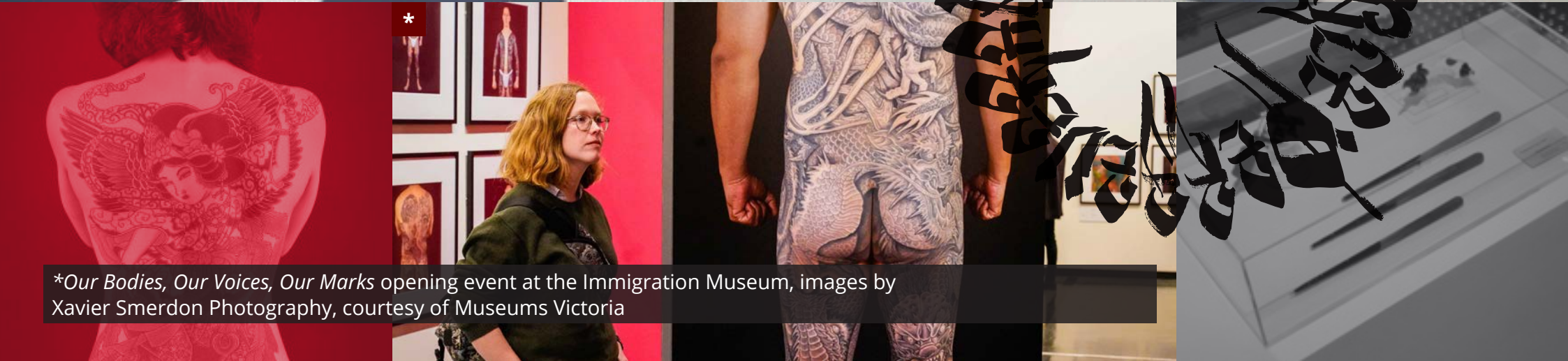
*Our Bodies, Our Voices, Our Marks opening event at the Immigration Museum