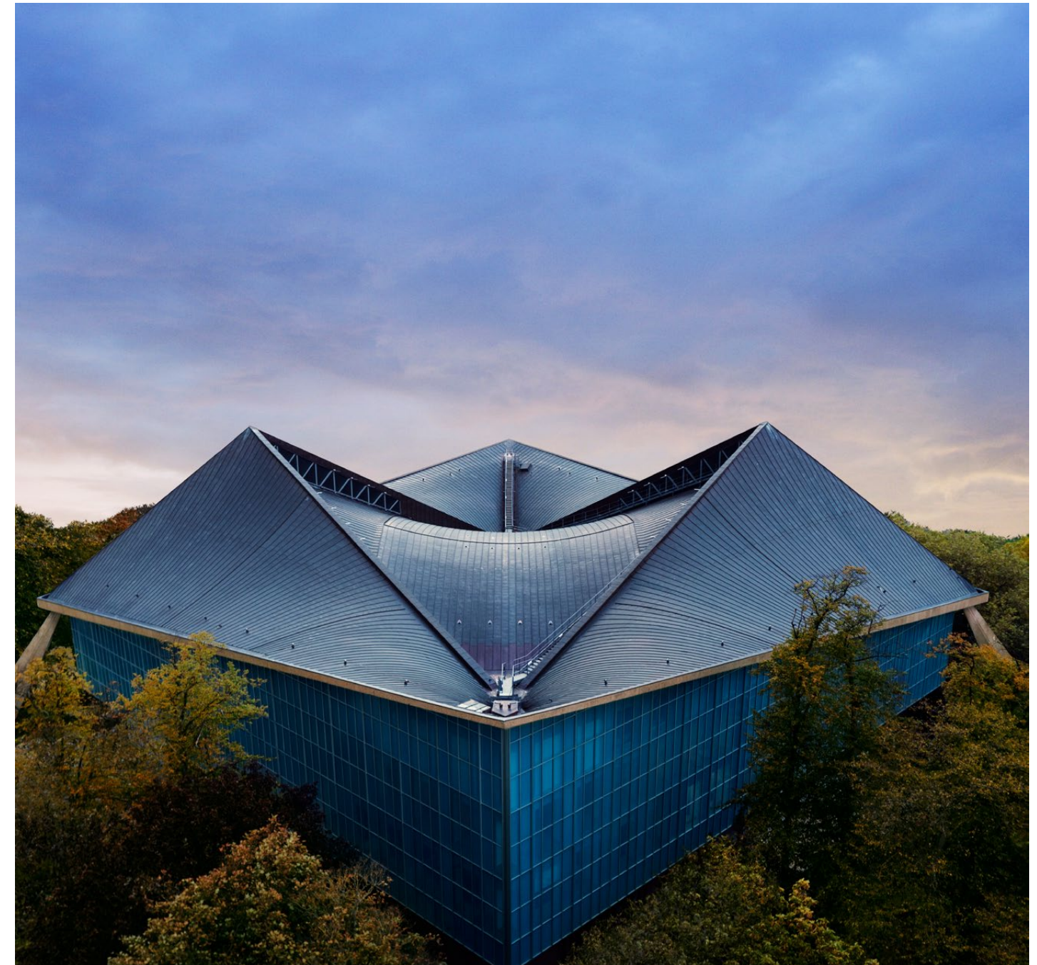
the Design Museum, London